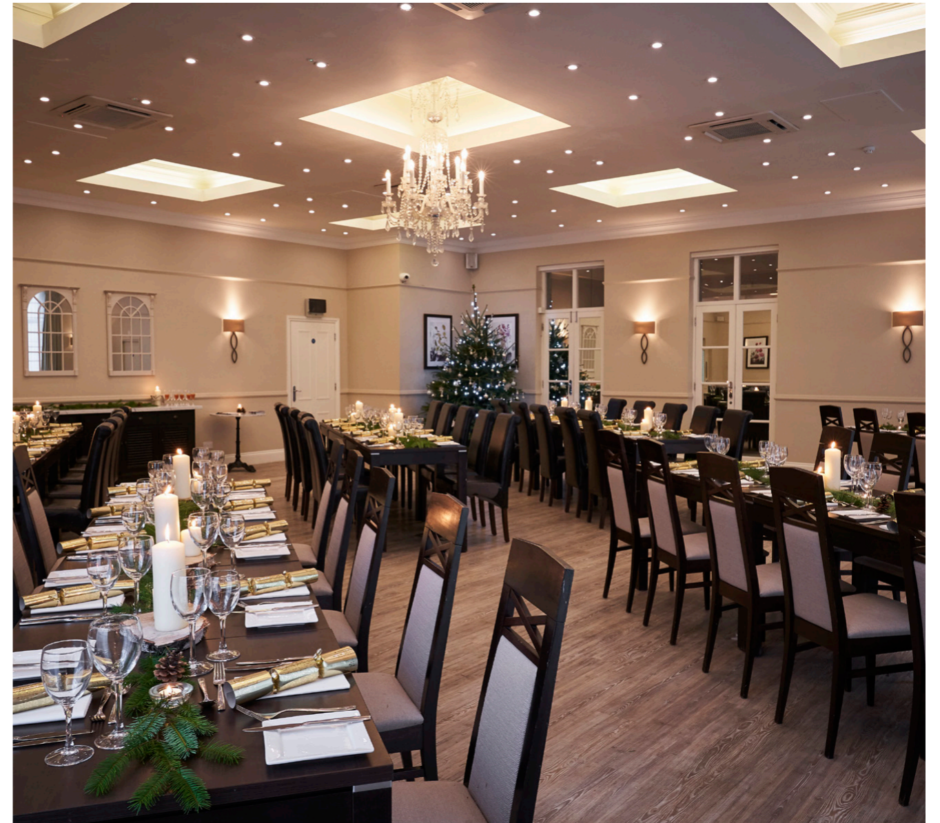
Forest Lodge, Pikes Hill, Lyndhurst, Hampshire, SO43 7AS