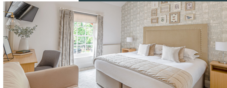
BARTLEY LODGE CADNAM