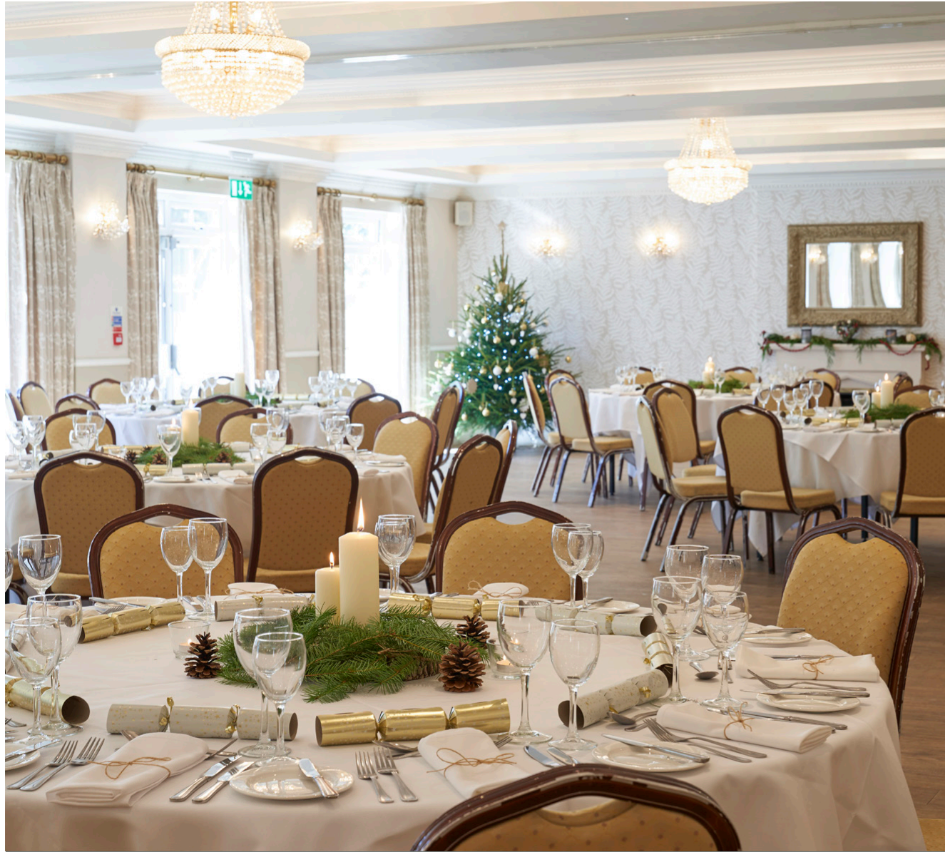
Beaulieu Inn, Beaulieu, Hampshire, SO42 7YQ