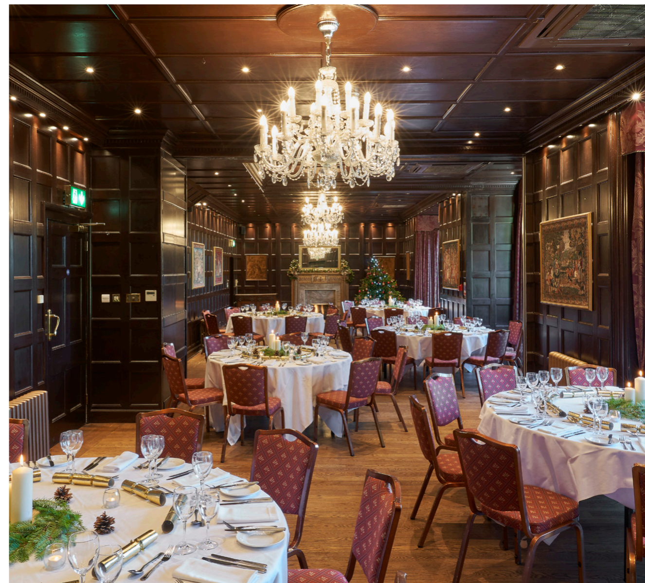
Bartley Lodge, Cadnam, Near Lyndhurst, Hampshire, SO40 2NR