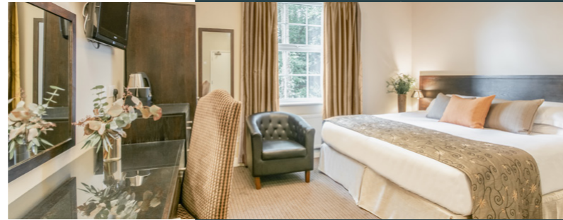
FOREST LODGE LYNDHURST

Supplement applies for single occupancy.