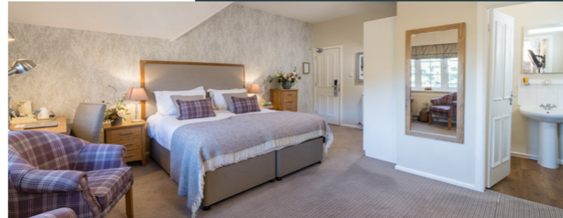
BEAULIEU INN BEAULIEU