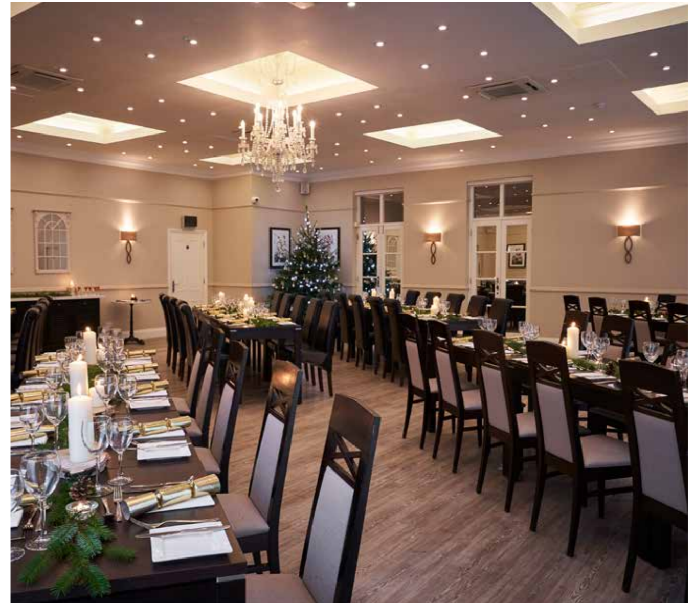
Forest Lodge, Pikes Hill, Romsey Road, Lyndhurst, SO43 7AS

If you are concerned about any food allergies or dietary requirements please speak to a member of the team who would be happy to assist. Please note a discretionary optional 10% service charge will be added to your final bill.