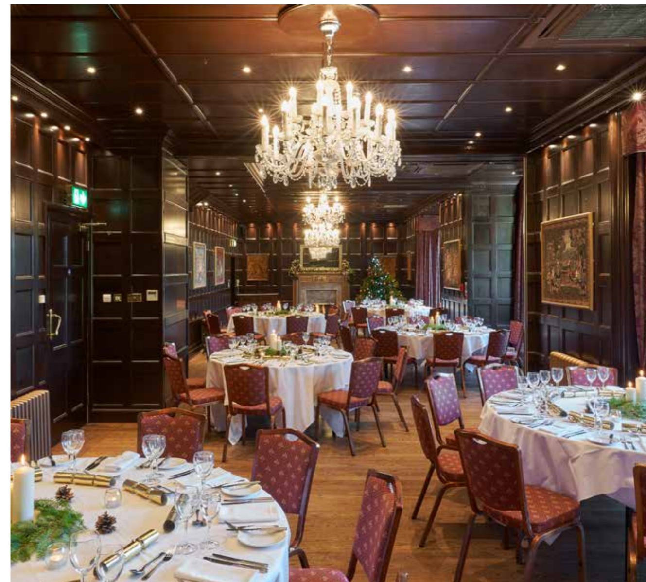
Bartley Lodge, Cadnam, Near Lyndhurst, Hampshire, SO40 2NR