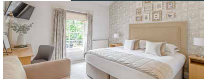
BARTLEY LODGE CADNAM