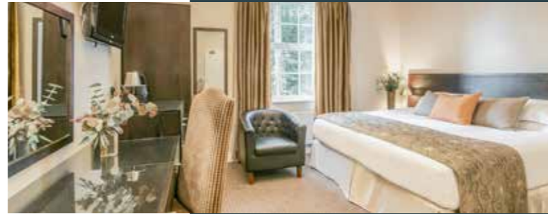
FOREST LODGE LYNDHURST

Supplement applies for single occupancy.