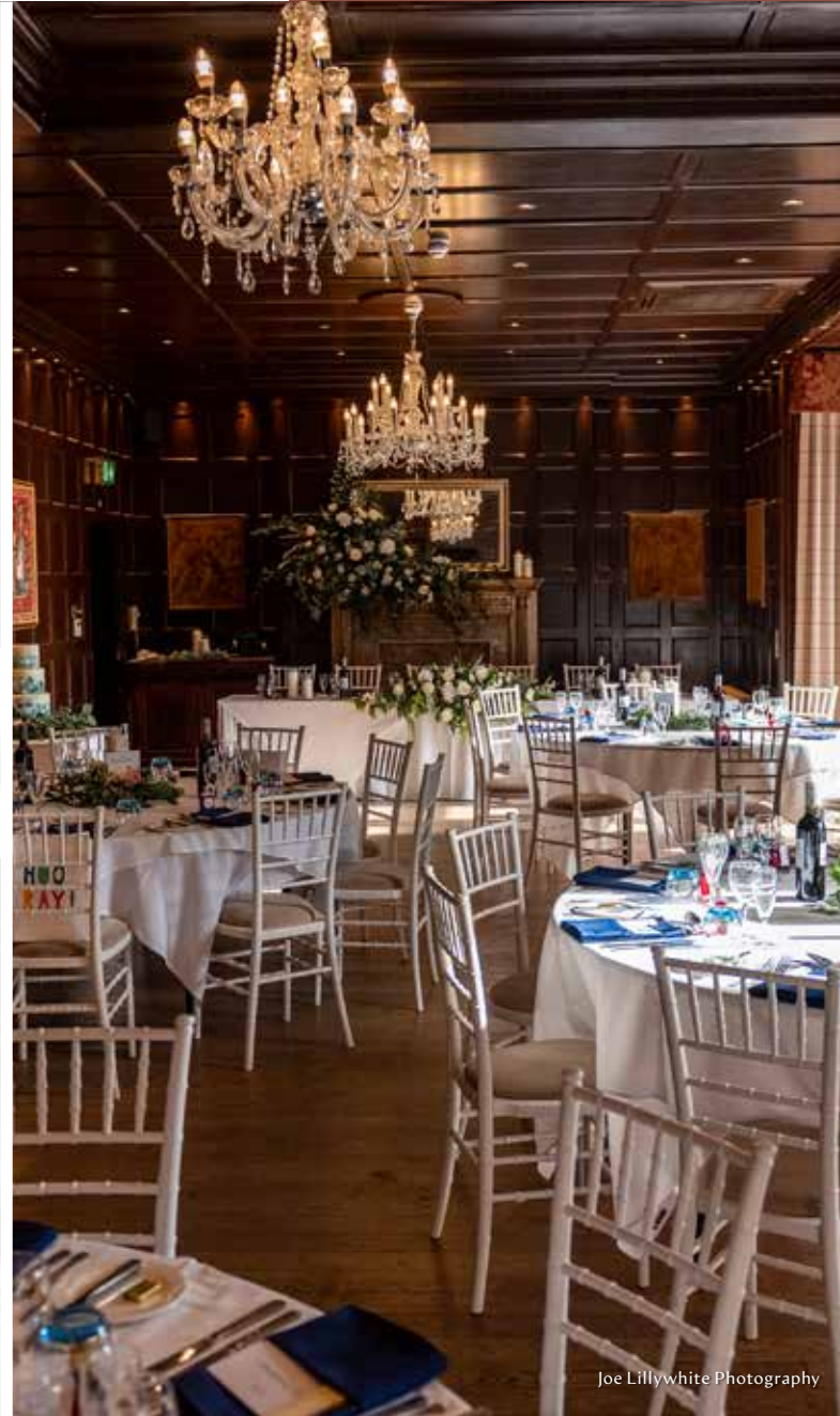
Joe Lillywhite Photography