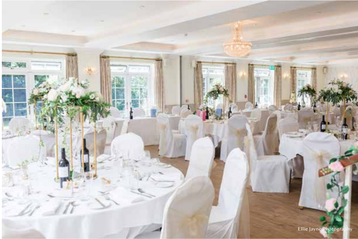
Ellie Jayne Photography