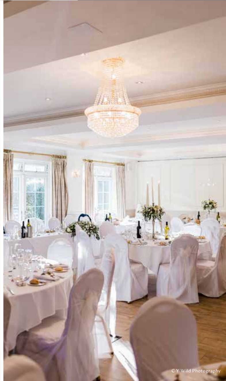
C Y Wild Photography