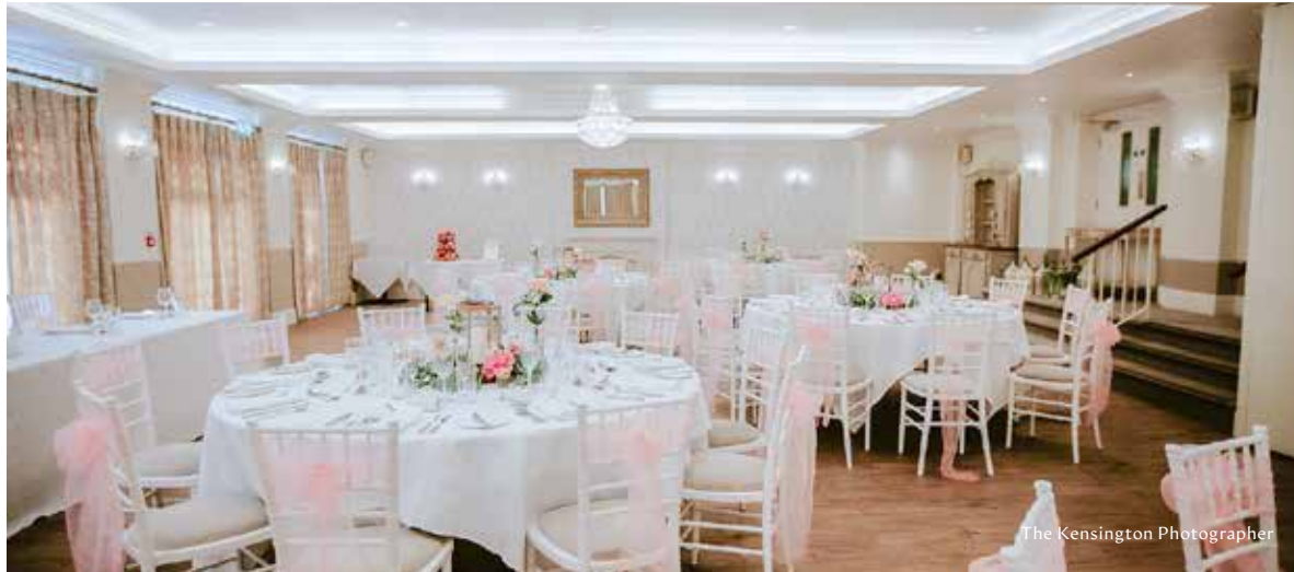
The Kensington Photographer