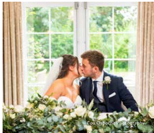
Lou Osborne Photography