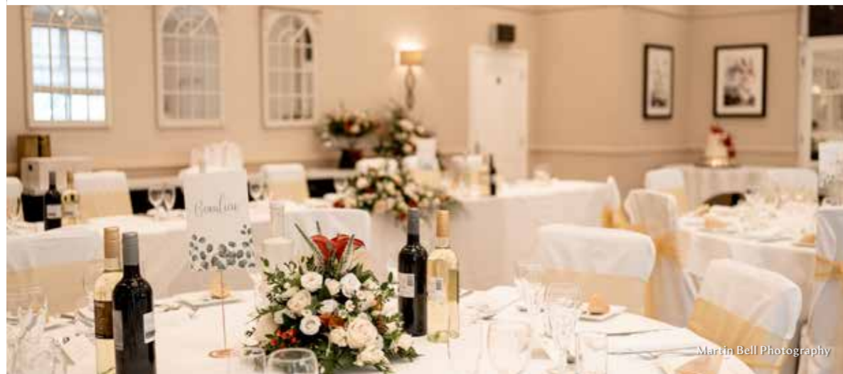
Martin Bell Photography