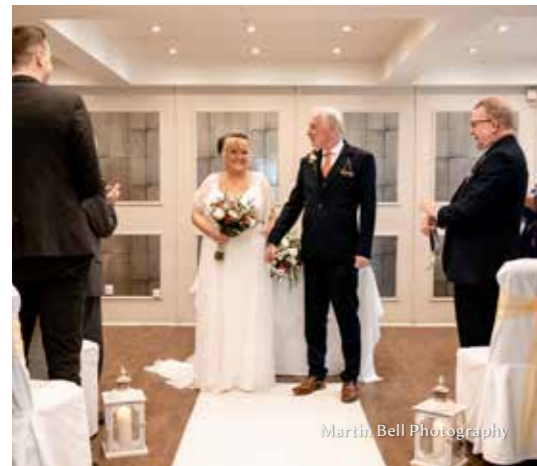
Martin Bell Photography